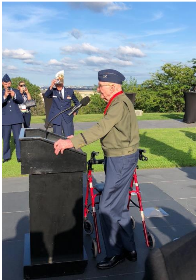
Colonel (ret) Gail "Hal" Halverson, aka the Berlin Airlift Candy Bomber speaks to the crowd at the 70th Anniversary of the Berlin Airlift.

West Berliners with food and fuel until September 30, 1949.