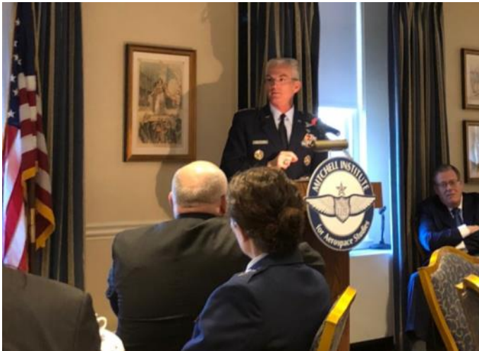
General Paul Silva spoke to members of the Mitchell Institute Nuclear Deterrence caucus about modernization of nuclear forces and modernization efforts in missile defense and space.

On Friday, August 10th, General Paul Selva, USAF, Vice Chairman of the Joint Chiefs of Staff spoke at Mitchell Institute Breakfast on Capitol Hill. The breakfast was part of the Mitchell Nuclear Deterrence Series and was well attended by a number of AFA Gabriel Chapter members. General Selva gave an update on Nuclear Deterrence issues and laid out priorities for future developments in Missile Defense, and Space.