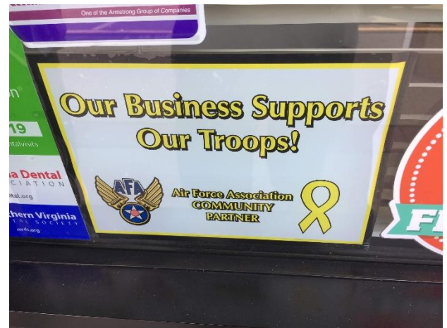
Your business can become a Gabriel Chapter Community Partner. If you would like more information on the Gabriel Chapter Community Partner or Corporate Sponsor program, contact VA433.gabriel@afa.org