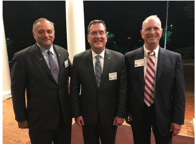
Gabriel Chapter leadership joined attended the Virginia AFA State Convention and EXCOM Meeting in Williamsburg, Virginia, hosted by the Langley Chapter

We are now entering the summer months and have several Chapter and National events coming up here in the National Capital Region, including the AFA National Convention, the AFA Field Awards Dinner, the AFA Air Space and Cyber