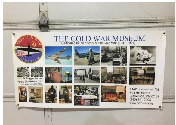
The Cold War Museum is a 501(c)(3) charitable organization. CWM is a Gabriel Chapter Community Partner and we are proud to recommend the excellent educational and professional developemnt opportunities at the Museum.

An AFA Gabriel Chapter Community Partner, the Cold War Museum® is a 501(c)(3) charitable organization dedicated to education, preservation, and research on the global, ideological, and political confrontations between East and West from the end of World War II to the dissolution of the Soviet Union. Located in Vint Hill, VA, the Museum Collection is housed in one of the former Vint Hill Farms Station buildings used during the Cold War by the US Army, the National Security Agency, and the Central Intelligence Agency to intercept and interpret coded messages. Museum collections are particularly strong with unusual artifacts in signals intelligence, image intelligence, aerial