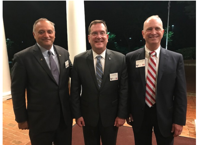
Sleep safe tonight, your EXCOM is awake!