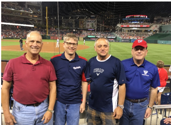
Gabriel Chapter leaders on hand to watch Washington Nationals clinch a Wildcard Playoff berth for the 2019 National League Pennant "quarter finals".